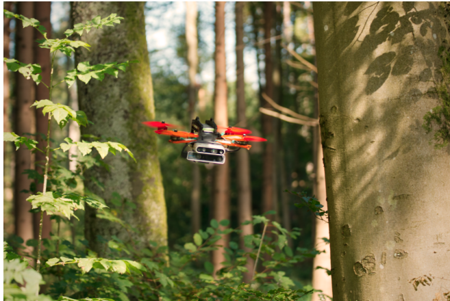
Fig. 1: Our drone flying at high speed through a forest using only onboard sensing and computing.

The authors are with the Robotics and Perception Group, Department of Informatics, University of Zurich, and Department of Neuroinformatics, University of Zurich and ETH Zurich, Switzerland ( https://rpg.ifi.uzh.ch ). This work was supported by the National Centre of Competence in Research (NCCR) Robotics through the Swiss National Science Foundation (SNSF) and the European Union’s Horizon 2020 Research and Innovation Programme under grant agreement No. 871479 (AERIAL-CORE) and the European Research Council (ERC) under grant agreement No. 864042 (AGILEFLIGHT).