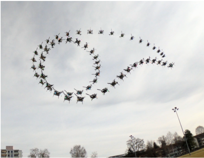
Fig. 2: Our quadrotor performs a Matty Flip. The drone is controlled by a deep sensorimotor policy and uses only onboard sensing and computation.